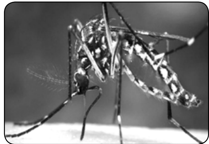
Elevated mosquito abundance, such as an increase in Aedes aegypti mosquitoes, and the presence of West Nile virus in other mosquitoes require treatments to reduce risks to Public Health

Controlling Aedes aegypti requires focused monitoring, testing and treatment to keep our communities healthy and safe. The District is proposing this assessment to address increased costs associated with addressing this invasive species. With an additional funding source, the District would be able to continue providing and improving year-round control of invasive mosquitoes and the diseases they carry. As well as be better prepared for the potential introduction of any other invasive mosquito species or emerging disease which may threaten the District residents